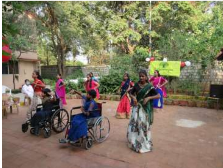
Wheelchair Dance performance