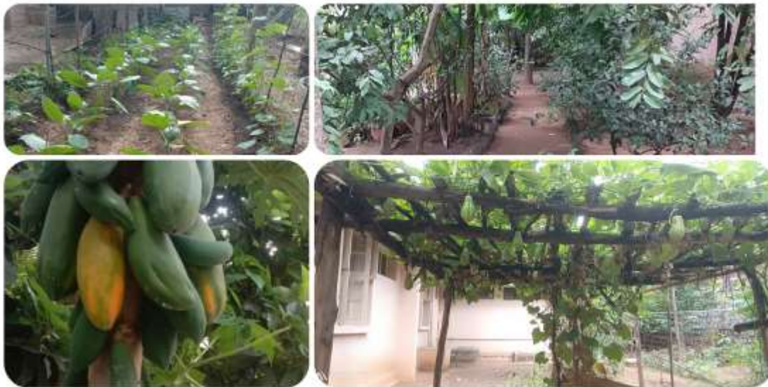
A scene of the thriving garden

This home has a lot of greenery surrounded by beautiful fruit trees and flowering plants and is home to several birds. Vegetables are also grown to be used in the kitchen. Spacious place like this is very rare to find in a city like Bangalore and the residents are being nurtured in such beautiful surroundings to help them grow to be confident young women.