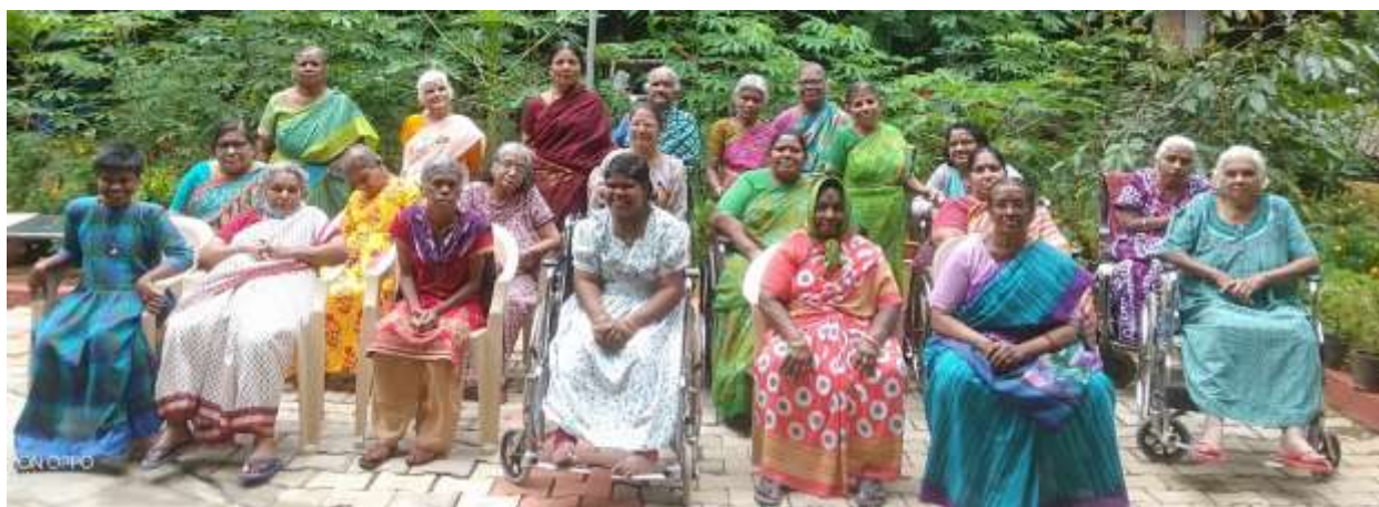
The present residents at the Whitefield Senior Citizens Home

The old age home in Whitefield is a spacious, well maintained place with beautiful trees and plants. We have 25 elderly and severely disabled women living in this home. This is a place created for the elderly women who have been abandoned by their family or have no family where they get love, care, and respect in their sunset years. It is also a place where they develop friendship and camaraderie with fellow residents which helps them deal with their lives better.