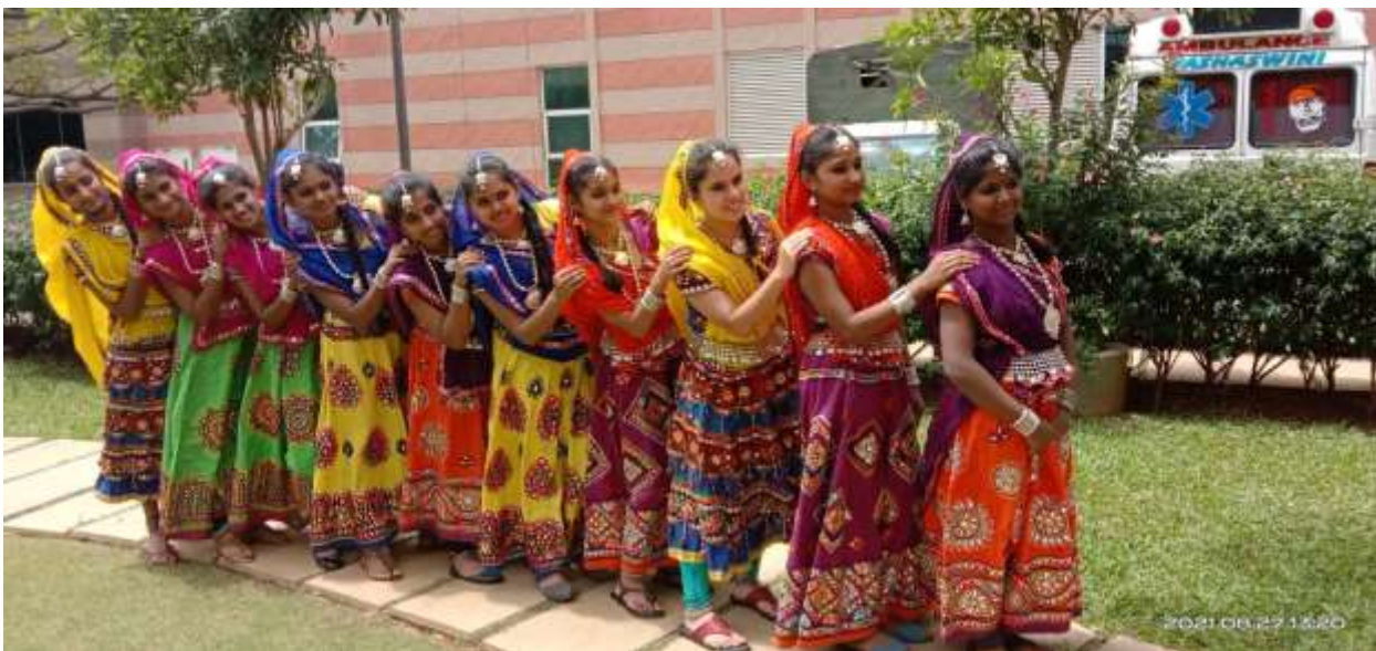
Residents in their dance costumes ready to perform

The children love to dance and a tutor has been engaged to teach them dance and he comes twice a week and teaches them dance. The HI girls are excellent dancers and follow the cues from the teacher helps them keep up with the beat and rhythm. They have been invited to perform at several venues during the year. The dance teacher also involves the wheelchair bound girls and has choreographed the dance with them.