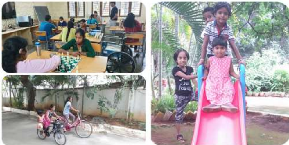
Recreation and Activity time at the HAL Airport Road Home