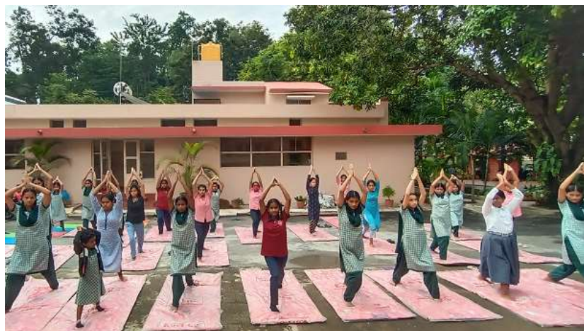
Celebrating Yoga Day