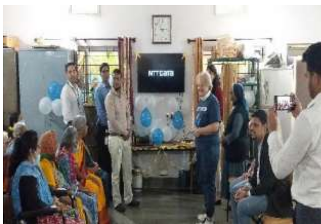
Figure 11: NTT Data Staff