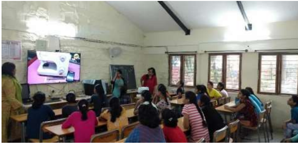
Figure 7: Sewing Workshop