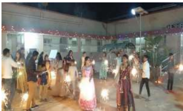
Figure 13: Diwali Celebrations

On Independence Day as was the practice for several years, Hotel Oberoi hosted a lunch for the residents of ARH. A small entertainment program was put up to entertain the staff of the hotel. Similarly, at WFH the day was celebrated with flag hoisting, games, and distribution of prizes. A Diwali party was organized at the ARH and family members of the children, a few donors and committee members were invited for the celebration. The guests were served catered food on that occasion. At the WFH several organisations, individuals and families kept visiting the home and spent time with the elders celebrating and bringing in the Christmas spirit. Sankranti was celebrated with the distribution of yellu-bella. Colt Technologies, Zen Desk, Firstsource, Shell is some of the organisations who visited ARH to celebrate Christmas by decorating the place, donating jackets and sweaters for all residents including staff and carol singing. A small and intimate party on the eve of Christmas was organized at ARH and the residents were all served yummy chat. It was a year of celebrations for the residents of CHIB.