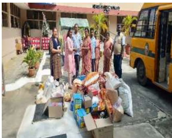
Figure 10: Bishop Cottons Donations