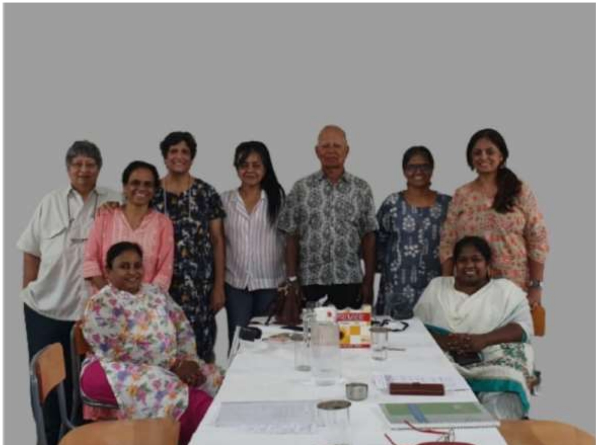
Figure 1: The Managing Committee Members