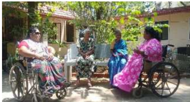
Figure 9: Whitefield Home