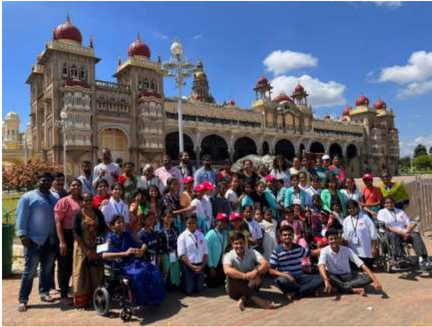
Figure 4: Mysore Trip

In the month of October 2022, the residents and staff were taken on a one-day exposure visit to Mysore. This trip was funded by BGSW and several of their volunteers from the organization accompanied the girls on this trip. The girls visited St. Philomena's Church, Mysore Palace, Chamarajendra Zoo and Brindavan gardens on this visit.