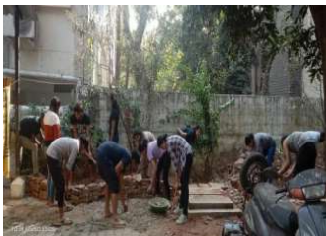
Figure 12: Students helping with gardening