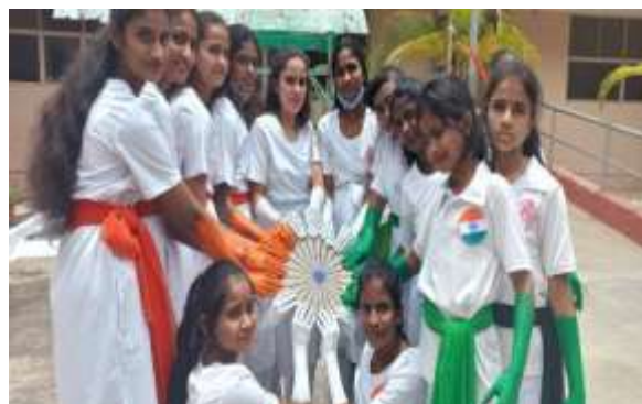
Figure 14: Independence Day