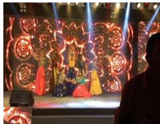
Figure 5: Goa Trip