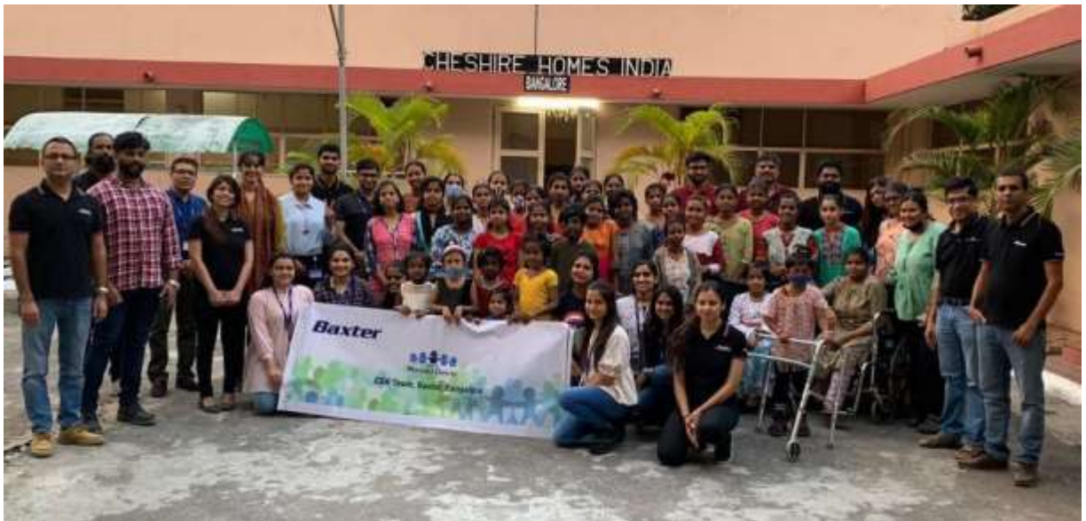
Figure 8: BAXTER staff with the girls after issuing the new hearing aids