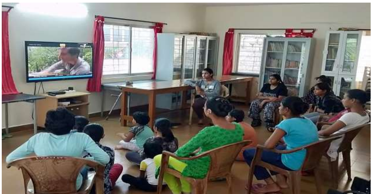
Group of residents watching a television programme in the recreation hall

To sensitize the local communities for support to PWDs (Persons With Disabilities) among them. This will assist them to avail schemes to lead better lives.